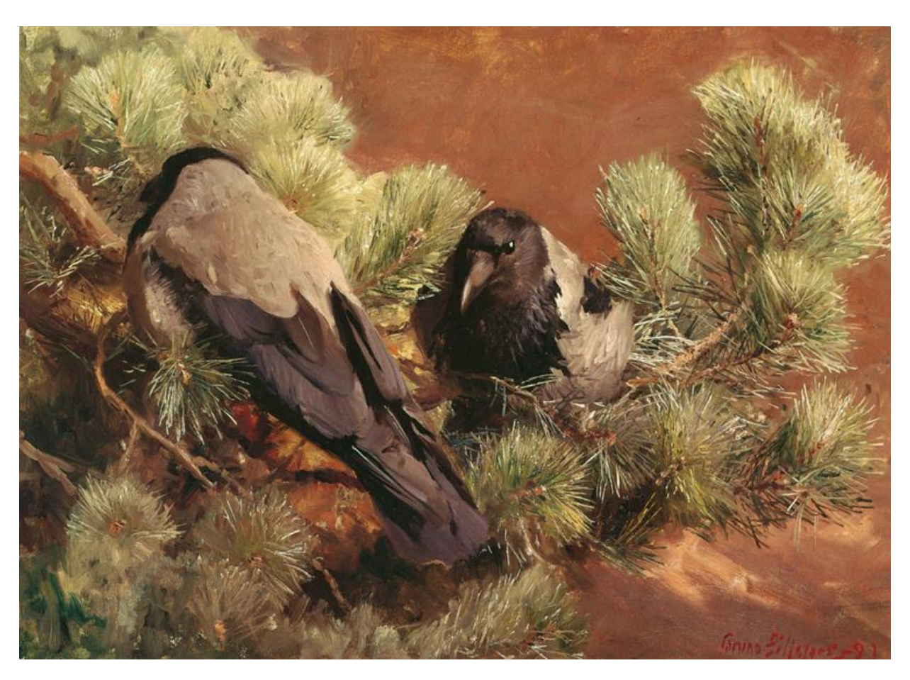
Hooded Crows, Bruno Liljefors, 1891, Gothenburg, Sweden

510 W. Ottawa Street • Lansing, Michigan 48933 (517) 482-0668 <a href="www.lansingfirstpres.com">www.lansingfirstpres.com</a> Facebook - Lansing First Presbyterian Summer Church Office Hours (M-Th) 8:00 a.m. - 4:00 p.m.